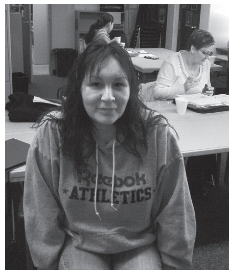
Welcome to SNAEC!