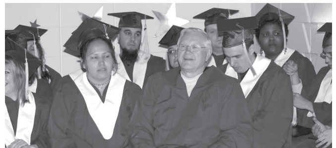
SNAEC Class of 2007

Come and enroll with us and join the Class of 2009. It may be one of the best decisions you have ever made .